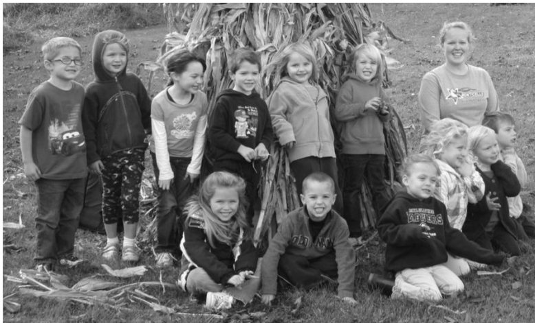
Top Photo is Morning 4K Group Bottom Photo is Afternoon 4K Group